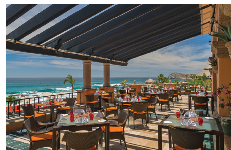
Clockwise from top: The Sheraton Grand Los Cabos; Tomatos restaurant; Los Cabos Arch.

Upper right photos courtesy of the Sheraton Grand; lower left photo by Cassandra Aquart